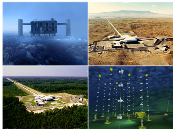
Figure 2: The four detectors that participated in the joint search. The neutrino detectors IceCube and ANTARES are shown in the upper left and lower right, respectively, while the gravitational-wave detectors LIGO Hanford and LIGO Livingston are shown in the upper right and lower left, respectively.

While there was no coincident detection this time, carrying out joint searches for gravitational waves and neutrinos from the most energetic cosmic phenomena represents an exciting new direction for high-energy astrophysics. The next few years will see the global network of gravitational-wave detectors enhanced significantly, as first Advanced Virgo in Italy, then KAGRA in Japan, and later a third LIGO detector in India begin science operations. These additional detectors will significantly improve our ability to locate the positions of gravitational-wave sources on the sky, which will in turn greatly improve our ability to carry out joint searches for gravitational waves and neutrinos. These searches could help us to understand how black holes might be connected to the emission of the highest energy particles that arrive every day from the distant cosmos.